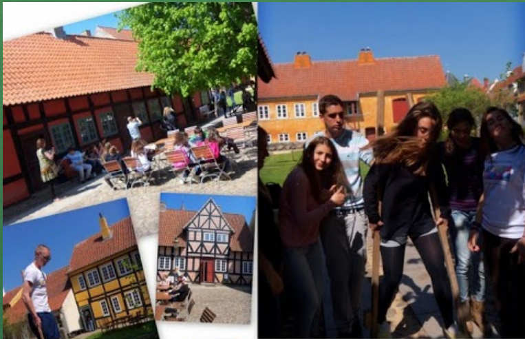
HOW FAMILY LIFE WAS IN THE PAST IN DENMARK