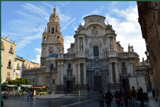
The cathedral of Murcia