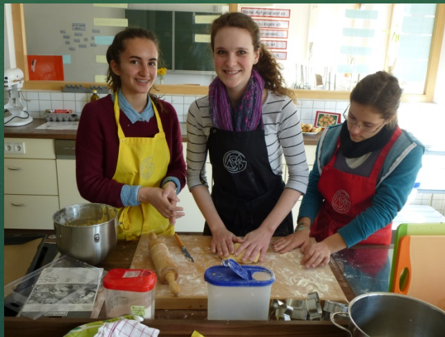
Easter traditions in Germany