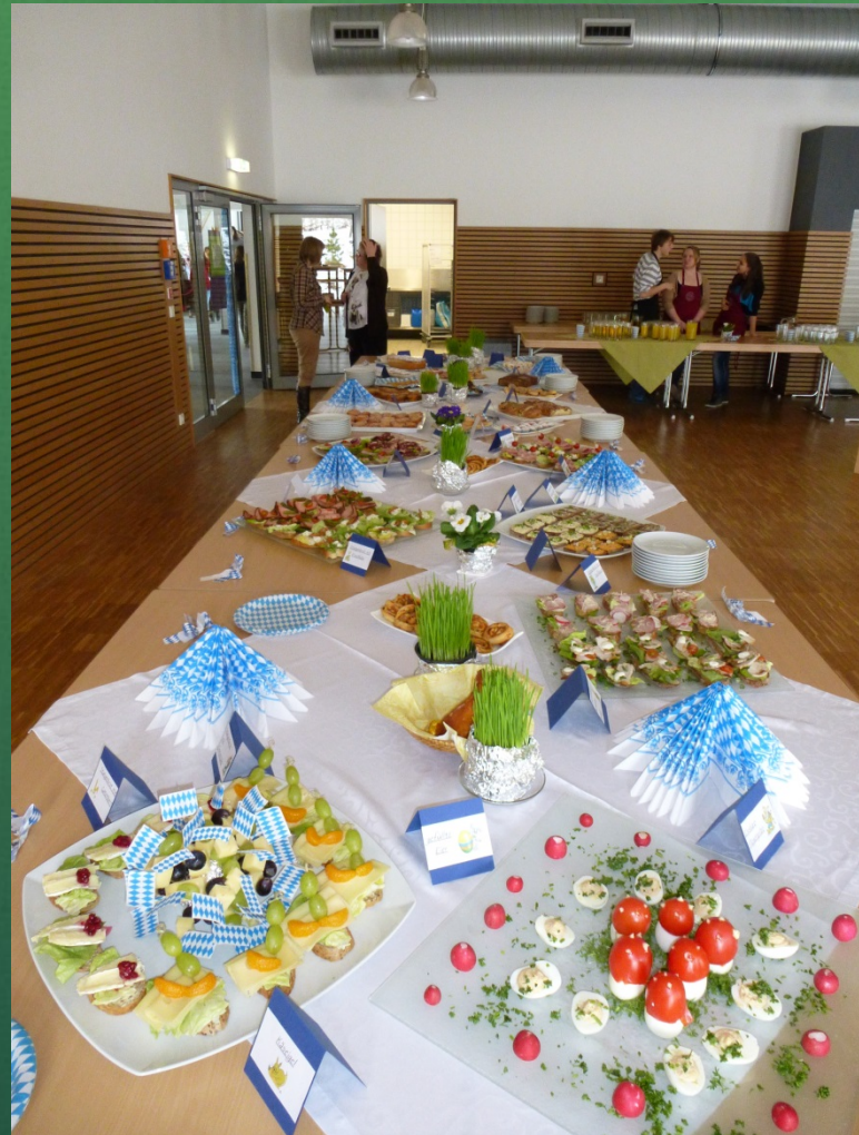
Fingerfood for the guests of the official welcome, made by students