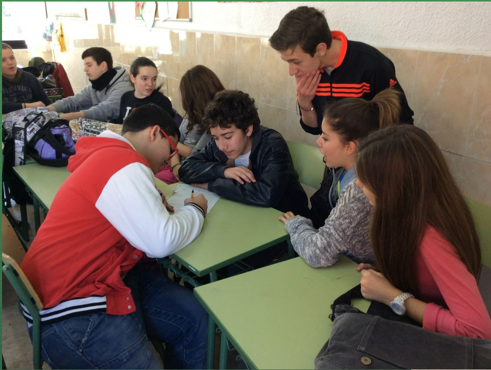
Spanish students writing essays