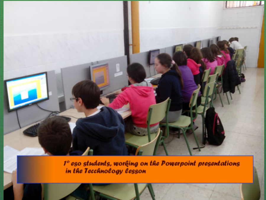
1° ego students, working on the Powerpoint presentations in the Tecchnology lesson