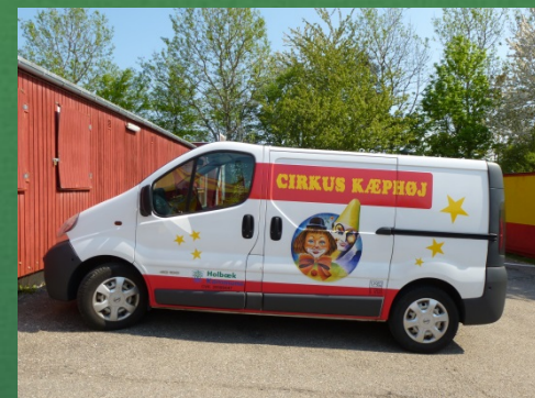
A circus made by students