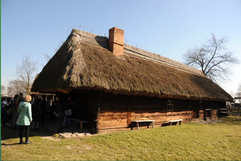
How people lived in former times