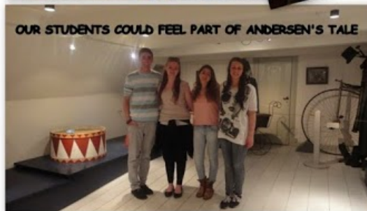
OUR STUDENTS COULD FEEL PART OF ANDERSEN'S TALE