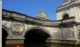
VISITING THE CITY OF COPENHAGEN