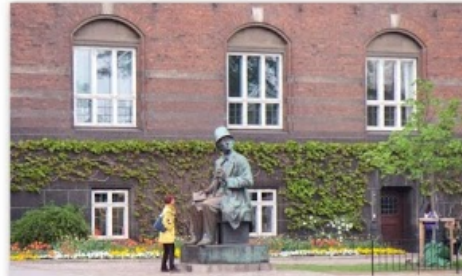
ANDERSEN & HIS FAIRY TALES