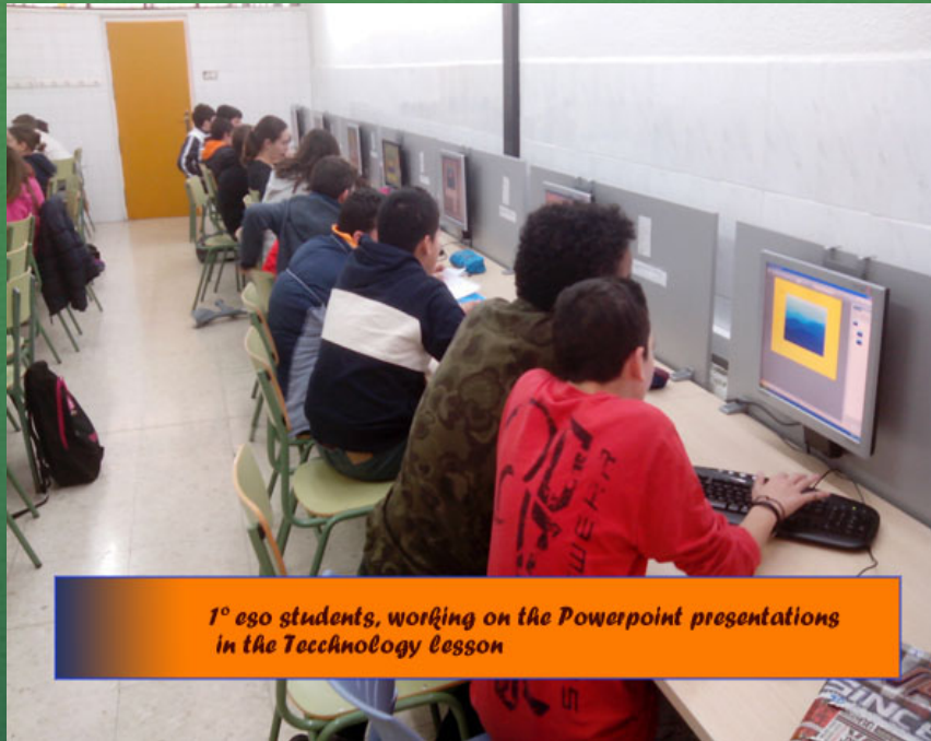
1° ego students, working on the Powerpoint presentations in the Tecchnology lesson