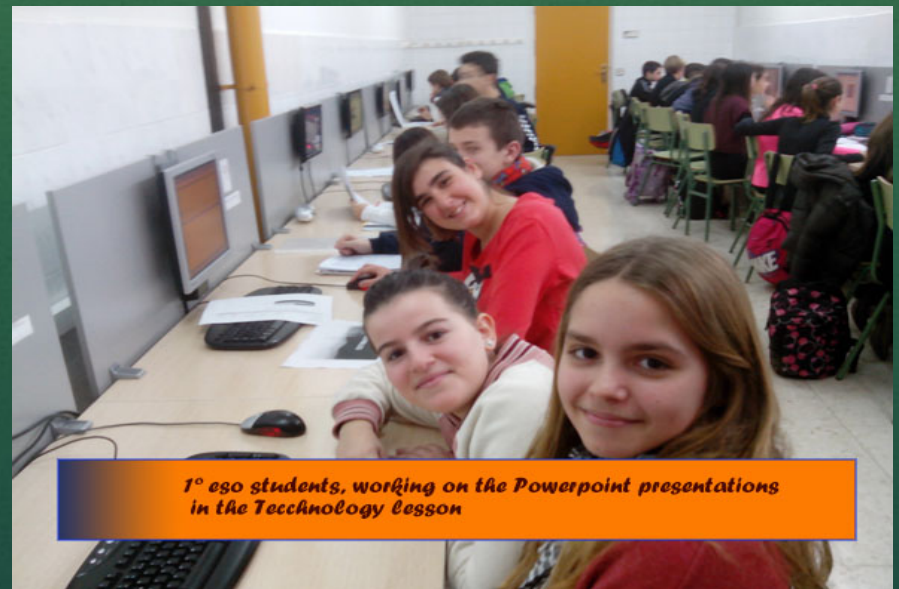
1° ego students, working on the Powerpoint presentations in the Tecchnology lesson