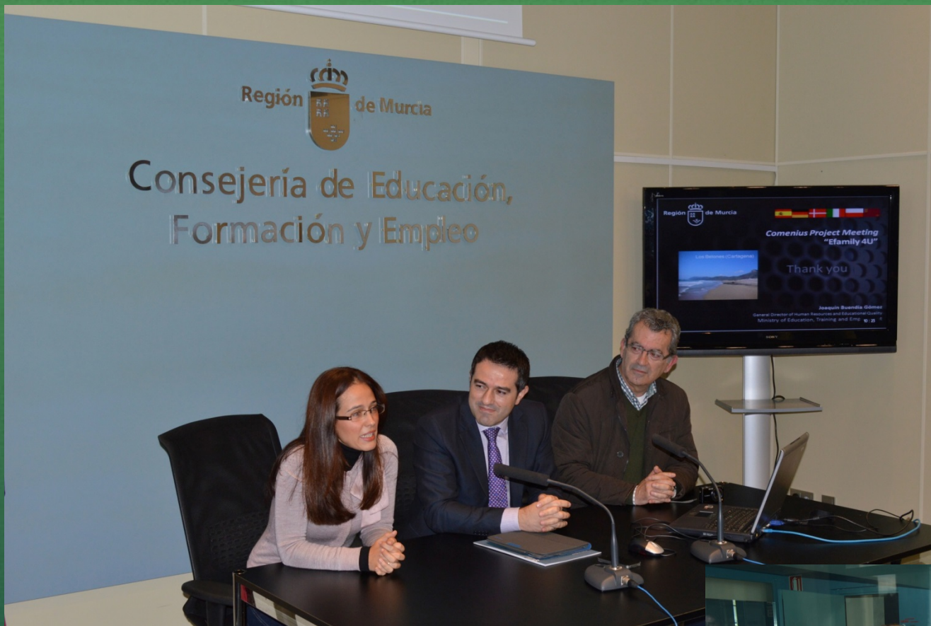
Official welcome in Murcia