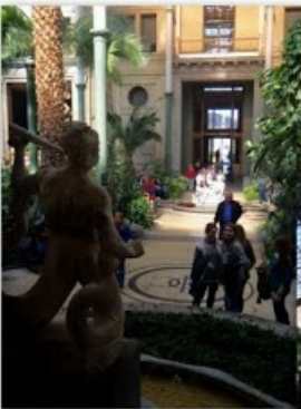
AT THE MUSEUM