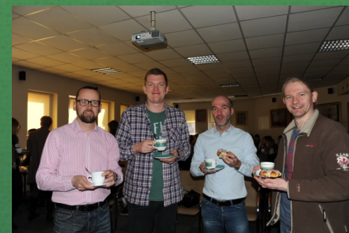
Another official welcome