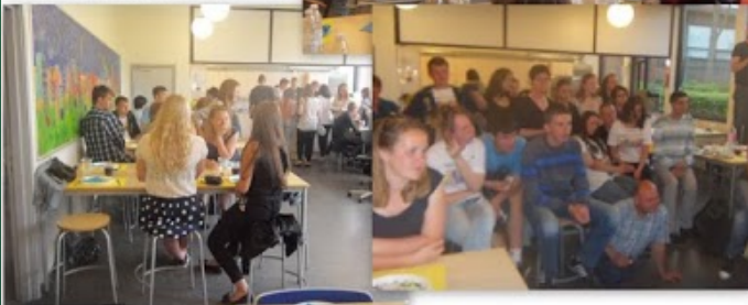
THEY KNOW HOW TO HAVE FUN