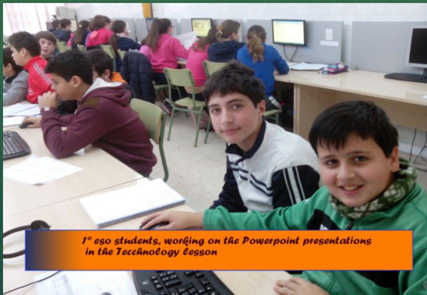
1° ego students, working on the Powerpoint presentations in the Tecchnology lesson