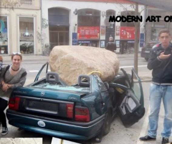
MODERN ART ON THE STREETS