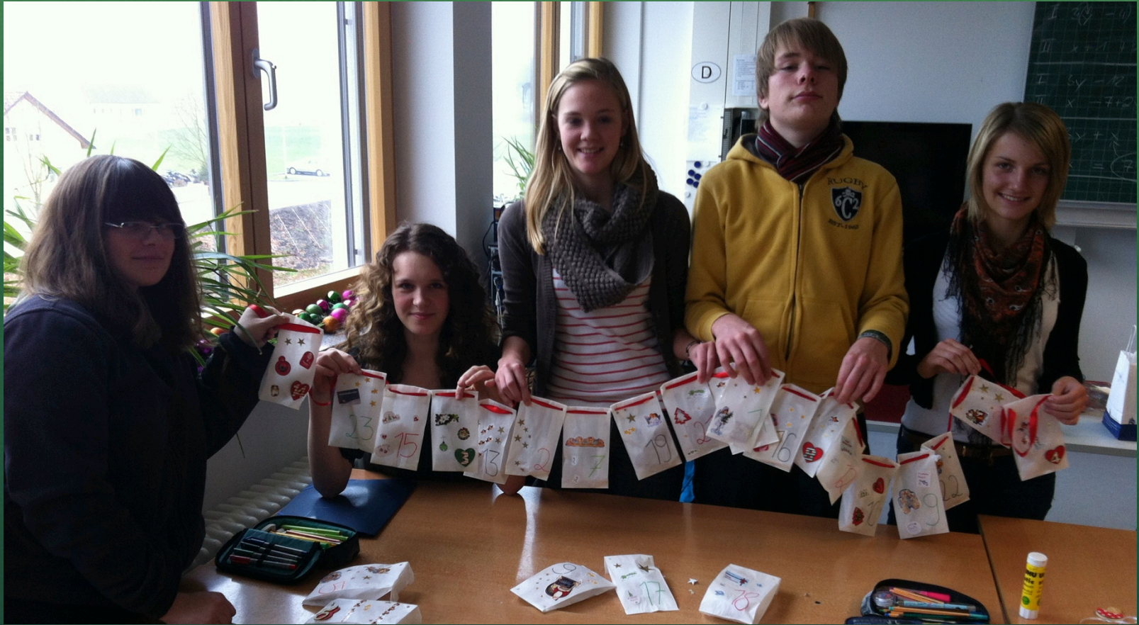
German students making presents for the foreign families