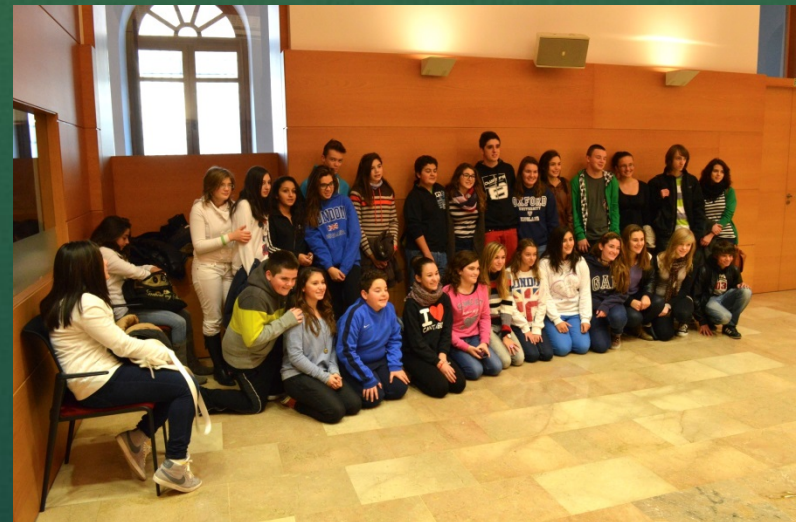
Another official welcome in Murcia