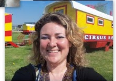
THEY EVEN HAVE A CIRCUS AS AN EXTRACURRICULAR ACTIVITY