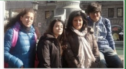
WITH OUR FRIENDS