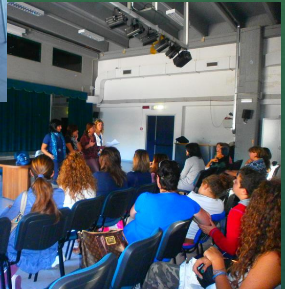
Parent's meeting in Italy