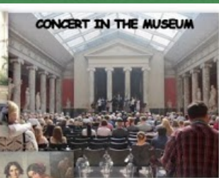
CONCERT IN THE MUSEUM