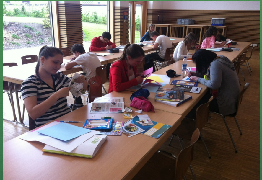
German students working on the family boxes