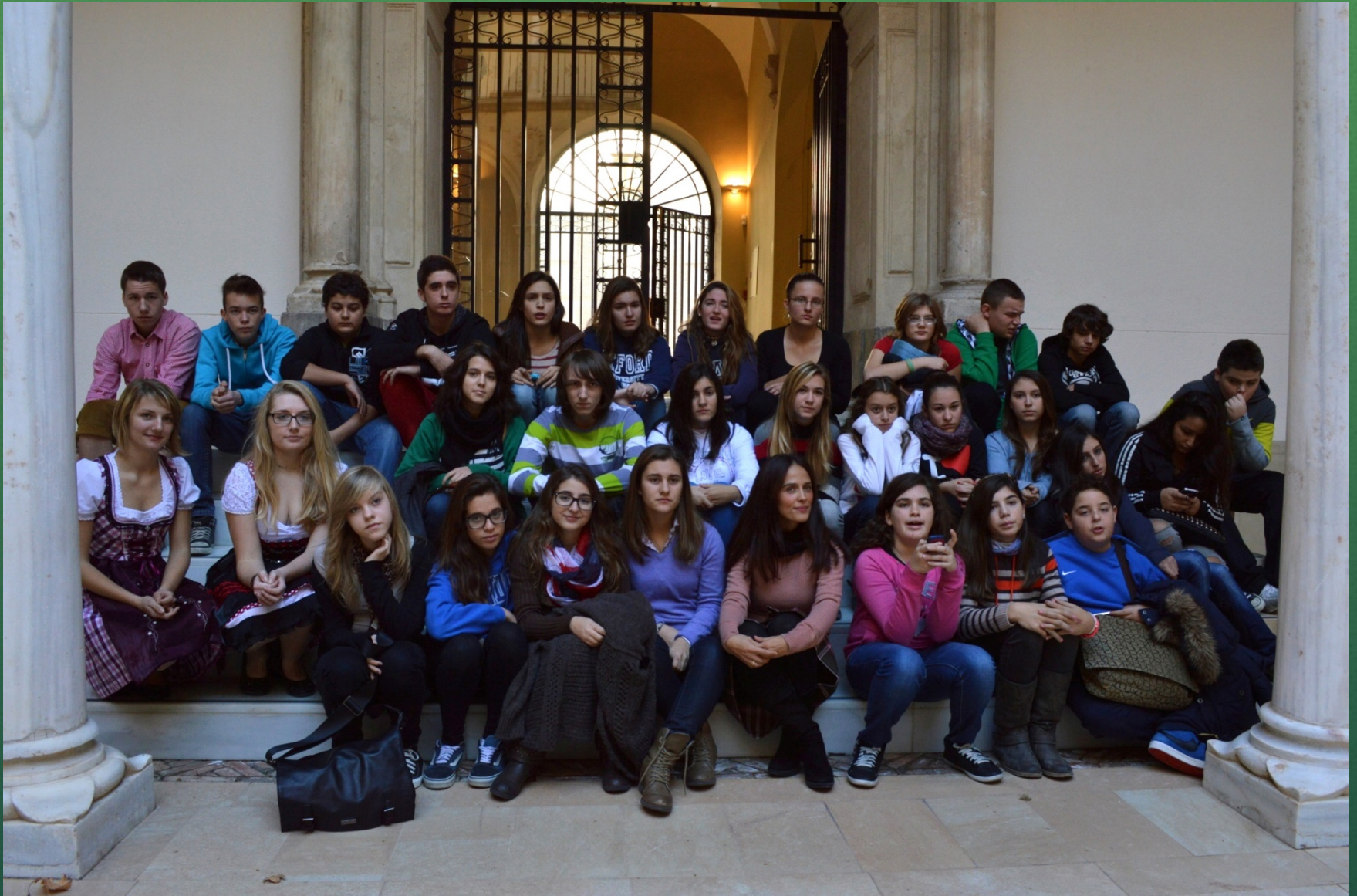
Cultural exchange with students from all countries